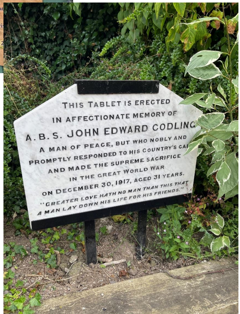
Friends of the ODA Memorial Gardens